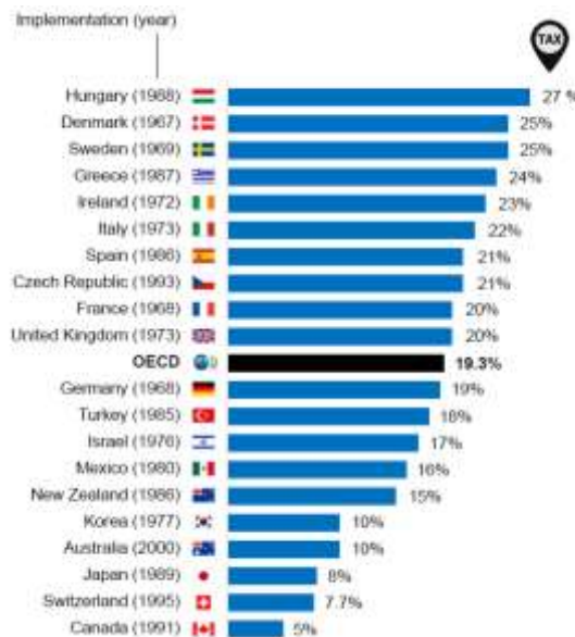
Figure 1.2 Standard VAT Rate in OECD Countries

government could be challenging. Ideally, VAT should be able to collect revenue from every transaction in every supply chain, from production to sales to end consumers. The government needs to carefully consider formulating policies, tax bases, tax rates, exemptions, and registration thresholds (Feria, 2021; and Zu, 2018). Each economy has diverse policies in terms of these four aspects. For example, members of the Organization for Economic Co-operation and Development (OECD) have a wide range of VAT rates (see Figure 1.2). In addition, many countries apply multirate systems and exemptions for certain transactions, goods, and services in various ways.